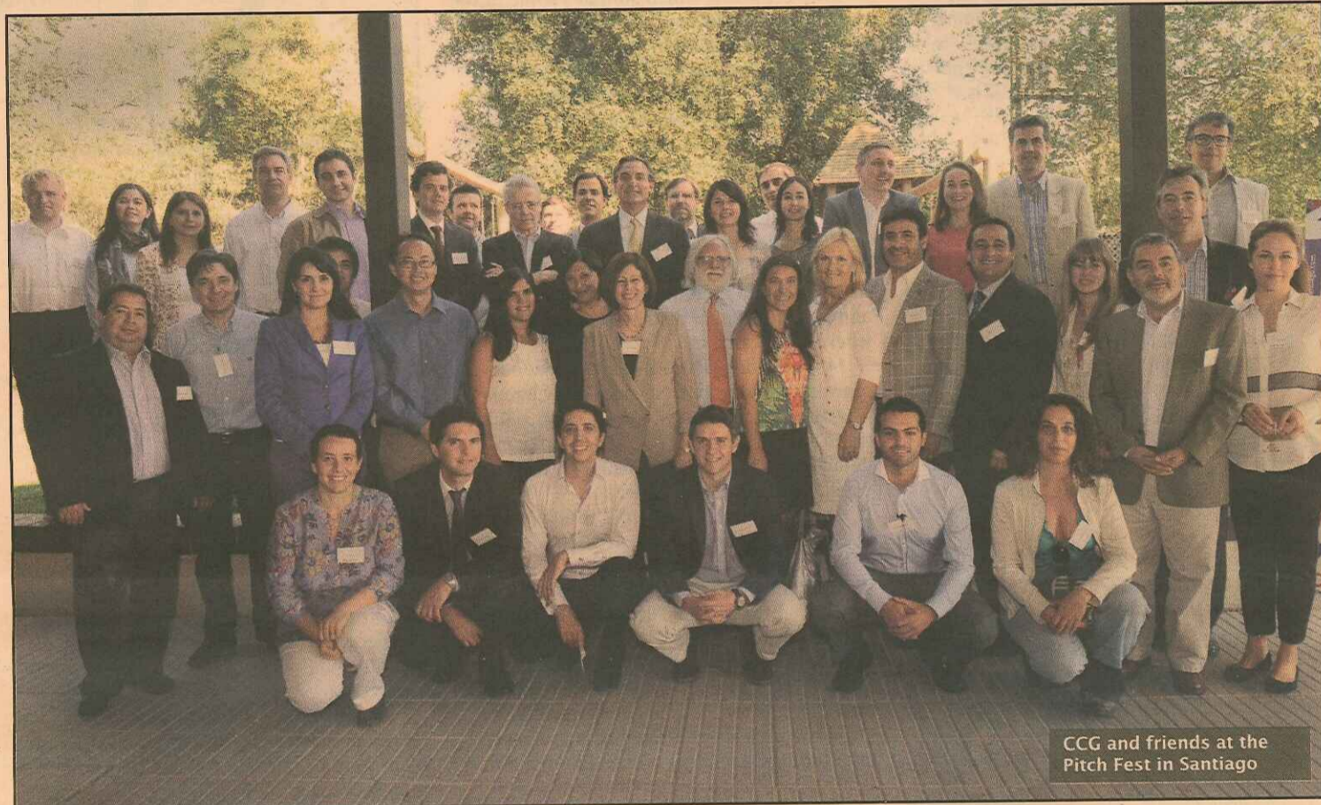
CCG and friends at the Pitch Fest in Santiago

Cambridge early-stage companies who took part in a 'Pitch Fest' at the Prince of Wales Country Club were Pneumacare, Ionscope and Knowledge Transmission - a portfolio company already selling into South America - as well as Cambridge Capital Group itself and eight local hi-tech start-ups.